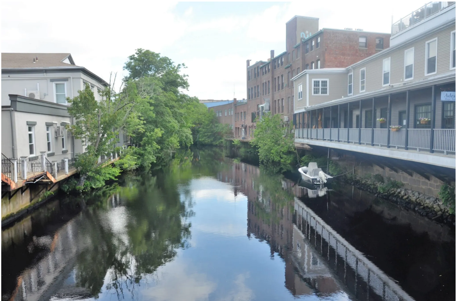
Photo from the Pawcatuck River Bridge, originally built in 1712 and rebuilt several times since. The river is the dividing line between Westerly, RI and the village of Pawcatuck in Stonington, CT.